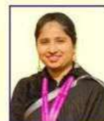
SHIWANGI PGT History at SD Model School, Jagadhri