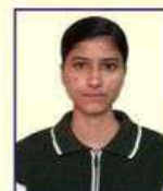
UMA Studying in MA at BHU, Varanasi